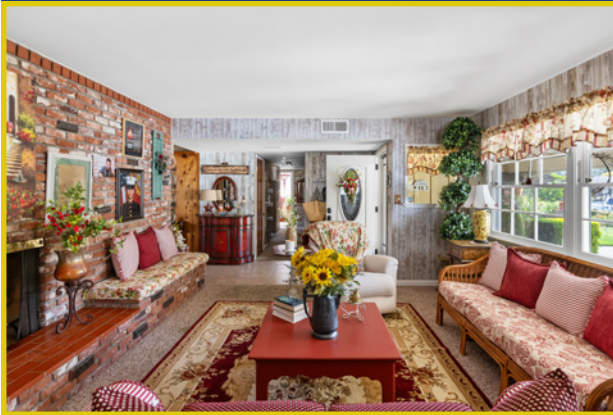
Living Room w/Brick Fireplace