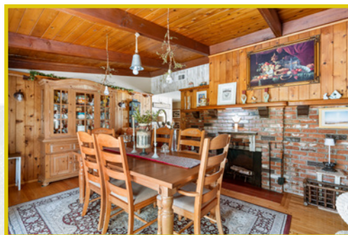
Family/Dining Room w/Fireplace